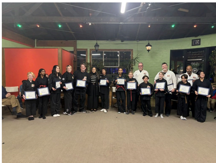
Many students and instructors were recognized for their hard work at the recent American School of Martial Arts Masters Night celebration.